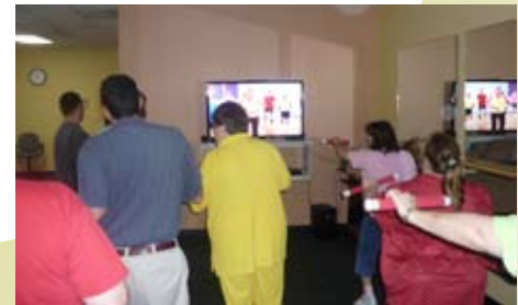
Pictured above BAC clients enjoy the new Movement Room

The Brevard Achievement Center (BAC), is pleased to announce the implementation of the new Movement Room. The Movement Room has six new televisions to include six Wii Fit stations that allow clients to become more physically active. Over the next few weeks, staff is planning to work with clients on their balance and coordination by using the Wii Fit stations. The clients have expressed the fact that they enjoy the interactive bowling and are looking forward to the upcoming workout videos. Many clients have stated that already, they can see a difference in the way they feel physically.